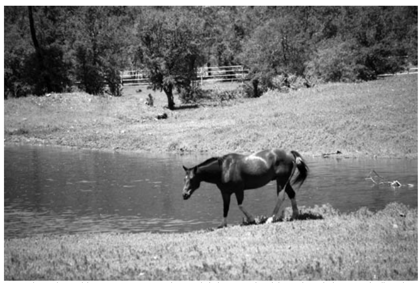
In general, it can be stated that equine sanctuaries must be assured of adequate supplies of clean and pure drinking water. If wells are the source of water, their capacity to deliver sufficient quantities of high quality water throughout the year must be assured.

While some sanctuaries may maintain their own water supply through on-site wells, the water needs and quality for most sanctuaries will be dictated by local governmental agencies. Similarly the means and methods for the control of water run-off and sewage release from sanctuary facilities will be dictated by the rules and regulations of local and state governments. In general, it can be stated that equine sanctuaries must be assured of adequate supplies of clean, pure drinking water. If wells are the source of water, their capacity to deliver sufficient quantities of high quality water throughout the year must be assured. Drainage