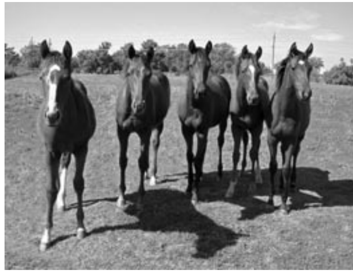
Horses develop strong social attachments to individual herd mates. Consequently, the grouping of individual hoses within pens, corrals, dry lots and pastures should be done with careful consideration.

aggressive behaviors such as fighting. All newly arrived horses should be quarantined (2-3 weeks) before mixing with resident horses. Before new horses are co-mingled, they can be exposed to the group by allowing an across-the-fence acquaintance period. All introductions of new individuals to each other regardless of group size should take place in daylight hours and under close supervision to avoid unnecessary harm or injury to horses.