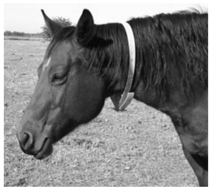
One important factor to remember when using external ID systems is that, while the material used to make these must be sufficiently durable to withstand daily wear and tear, it must not be so strong that it cannot be broken by the animal that becomes trapped or ensnarled on fences, feeders, waterers, etc.

One of the drawbacks of microchips and other methods of permanent ID is that these do not allow for ready visual identification of horses. For this reason many farms and sanctuaries will combine those identification methods with neck tags, labeled halters or neck collars. All of these are acceptable as they can be marked with names or numbers for instant recognition. The labels can also be color coded if desired to designate gender (St, Fe, Geld) or herd groups, if desired. One important factor to remember when using these types of external ID systems is that while the material used to make these must be sufficiently durable to withstand daily wear and tear, it must not be so strong that it cannot be broken by the animal that becomes trapped or ensnarled on fences, feeders, waterers, etc. This is especially important for foals and weanlings for not only are they more