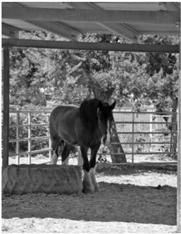
In areas of temperate winters and more days of heat and sunshine, simple pole and roof constructed shelters which protect from moderate rain and intensive heat may be preferable.

or electrical lighting supplied must be properly constructed and protected from the strains of horse manipulation and weather. If feed bunks are to be included in shelters, they should be of sufficient numbers or be large enough so that all horses can feed at once and avoid aggressive behaviors between animals.