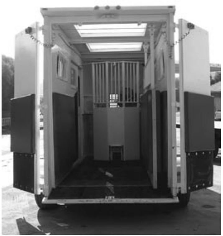
Health care emergencies are always a possibility within horse facilities, and these often require that afflicted animals be transported rapidly at any given hour of the day for immediate hospital care. Consequently, it is essential that all such operations have permanent and ready access, if not outright ownership, of some type of horse hauling equipment.

horses on and off the farm. Horses to be rescued most often need to be transported from their current location to the rescue or sanctuary facility, and resident horses may need transportation to new homes or veterinary facilities. Health care emergencies are always a possibility within horse facilities, and these often require that afflicted animals be transported rapidly at any given hour of the day for immediate hospital care. Consequently, it is essential that all such operations have permanent and ready access, if not outright ownership of some type of horse hauling equipment. The selection of equipment, be it horse vans or trailers, will vary depending on the size of the sanctuary operations, the type, numbers and sizes of animals routinely transported and the budgetary limits of the operating agency. Regardless of the type of vehicles chosen, these must be adequately maintained in operational order and "street ready" at all times. Employees should be adequately trained in their use and well practiced in the proper method for loading and unloading horses from the vehicle